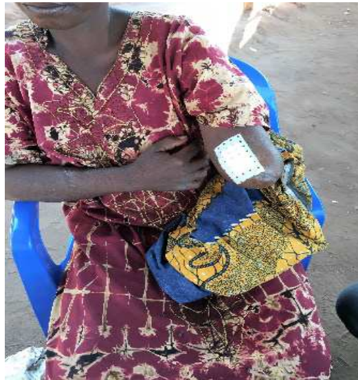
A female survivor of the attack on Cinq by the Bana Mura militia on 24 April. She had her arm amputated in an Angolan hospital after she fled the DRC (Photo taken by OHCHR on 18 June 2017)

46. Another survivor interviewed was hiding in her home in Cinq on 24 April when militia elements entered and attacked her with a machete. Her left arm was sliced off (see Photo below). She was able to flee despite her wound, hid in the forest for several days before reaching the Angolan border, and was airlifted by an Angolan Government helicopter to the hospital in Dundo.