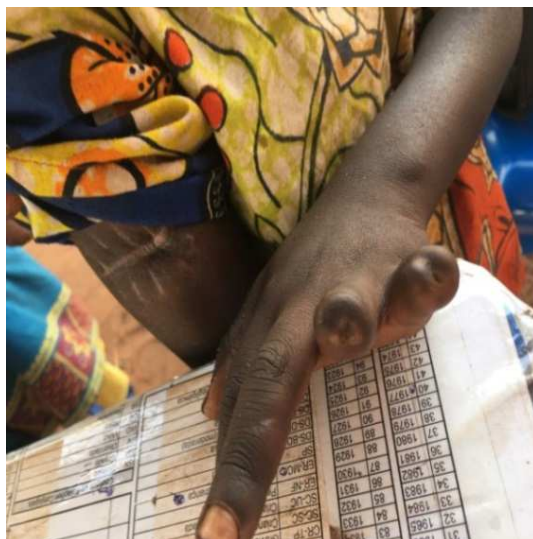
Child from the village of Cinq whose fingers were chopped off by machete by a local leader on 24 April 2017

45. The team interviewed a mother with her seven-year old son who had been caught by a traditional leader in Cinq as he was trying to escape from the village on 24 April. The local leader chopped some of his fingers off (see photo below) while other attackers sliced open his face and arm. The face of the boy was totally disfigured.